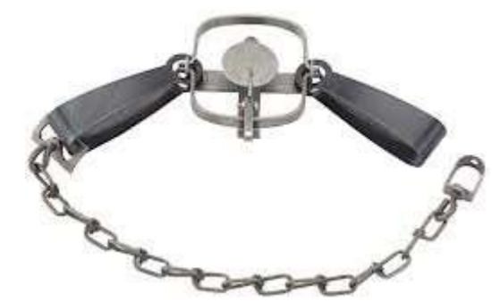
Coil Spring Trap